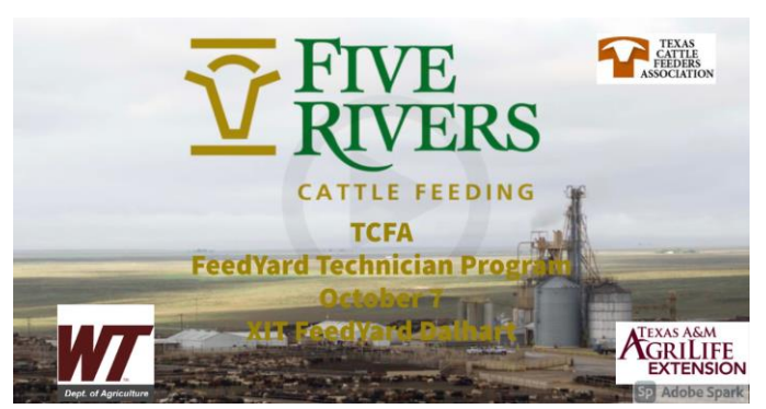
October 7, 2021