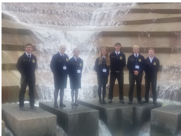
Texas FFA State Convention Ft Worth