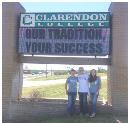
Area 1 Leadership Camp Clarendon