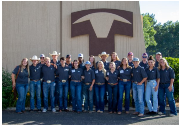
Texas Cattle Feeders Feed Yard Leadership Camp

Now taking applications for the Fall TCFA Machinery, Feed Mill Safety, and Skills Certifications for 11-12 grade.