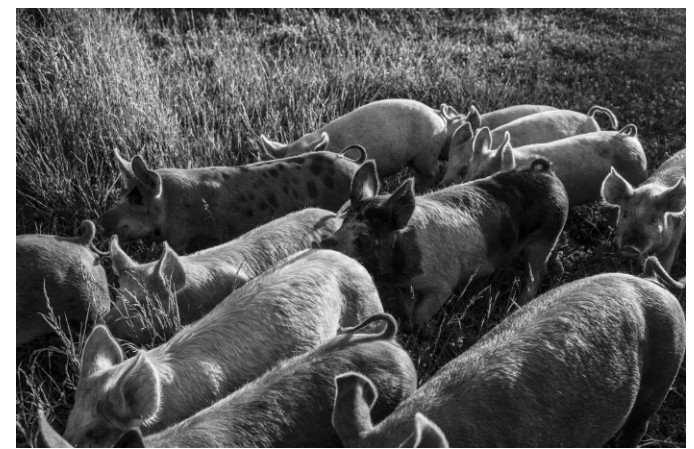
Pig Sales Trail.... The next great pig hunt has started. If you haven't ordered tags of barrows, now is the time to get it done.