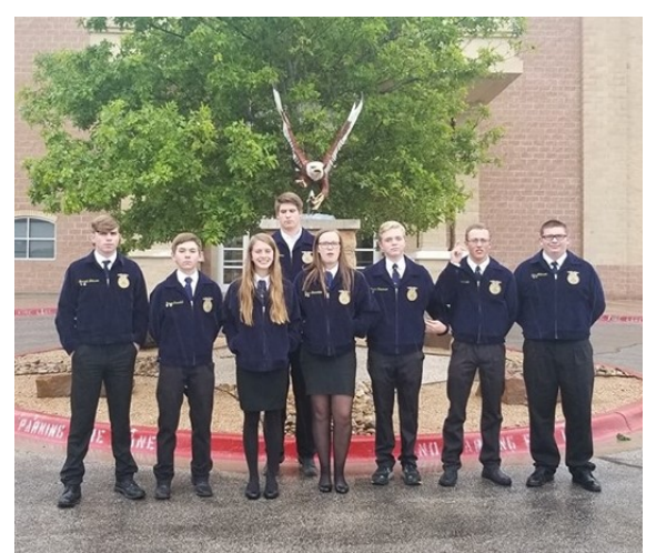
Area 1 Convention May 10-11 Canyon High School